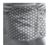
Skirts That Are Distracting