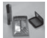
Fake Nails & Make-up